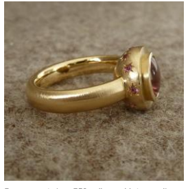
Wedding bands: 750 yellow gold, pink diamonds.

"I myself have a great passion for Natural Fancy Coloured Diamonds and have noticed a growing interest among my customers. Demand is increasing."