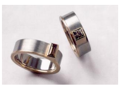
Wedding rings: 750 white and rose gold, baguettes and princess, cognac colour. © Atelier K. (Cologne)

"The key is to communicate. For me, white diamonds often create too hard of an effect. Natural Fancy Coloured Diamonds, especially champagne and cognac shades, blend more easily with different skin types."